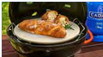
PIZZA / BAKING STONE