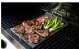
STAINLESS STEEL TEPPANYAKI PLATE