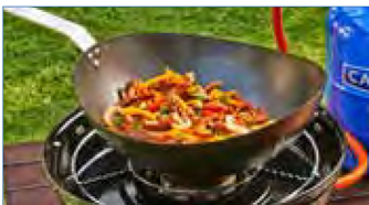
POT STAND & WOK