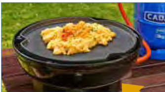
NON-STICK REVERSIBLE FLAT / RIBBED GRILL PLATE